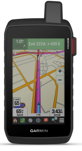
CITY NAVIGATO MAPS