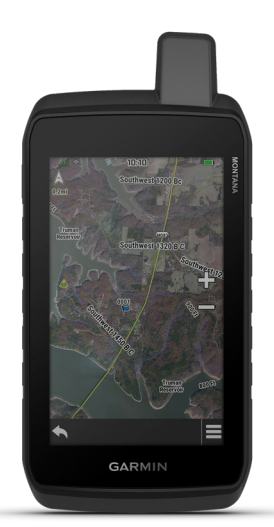
BIRDSEYE 8 MPCAMERA SATELLITE IMAGERY