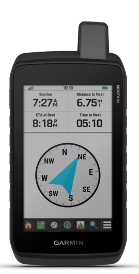
3-AXIS ELECTRONIC COMPASS